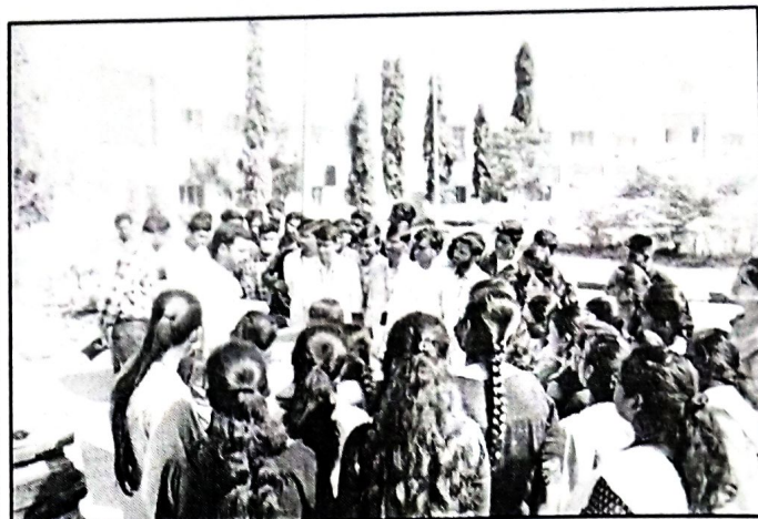
Scientists demonstrating (L) Measuring of Ground Potential (R) Different Rocks & Marbles

The Speakers who were Senior Scientists working at GSITI highlighted various aspects of geology starting from study, mining, application & use of geo-informatics and many more that has impact in today's arena as quality check, suitability & use of land and other mineral resources for mining & other applications still resides in the hands of central government.