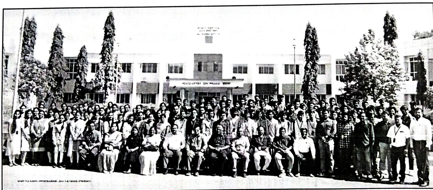
Group Picture of ECE staff & students with GSI Officials

The Speakers who were Senior Scientists working at GSITI highlighted various aspects of geology starting from study, mining, application & use of geo-informatics and many more that has impact in today's arena as quality check, suitability & use of land and other mineral resources for mining & other applications still resides in the hands of central government.